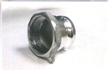
PART A - MALE ADAPTER X FEMALE THREAD