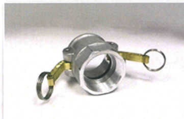
PART D - FEMALE COUPLER X FEMALE THREAD