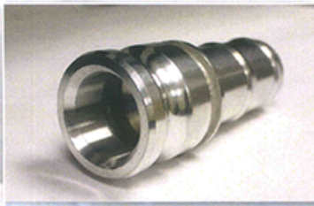
PART E - MALE ADAPTER X HOSE SHANK