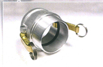
PART B - FEMALE COUPLER X MALE THREAD