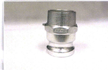
PART F - MALE ADAPTER X MALE THREAD