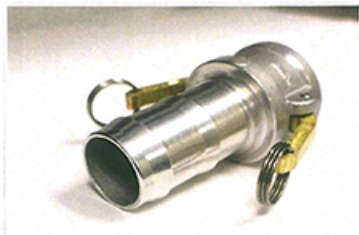
PART C - FEMALE COUPLER X HOSE SHANK